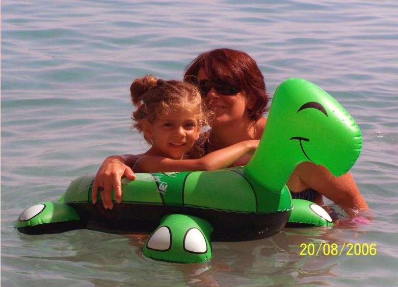
My mum and me in Greece